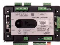
ComAp IntelliGen 200